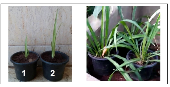
Fig. 4. Effect of different potting media on Dracaena umbraculifera treatments from left to right (1) peatmoss + sand mixture (1:1, v/v), (2) peatmoss only.

Results in Table (6) revealed that the effect of growing media on photosynthetic pigments content (total chlorophyll and carotenoids) and the percentage of total soluble sugars were significantly. The highest content in this regard was recorded in leaves of plants grown on peat moss only (0.737, 0.280 and 9.91 mg/g f.w.,