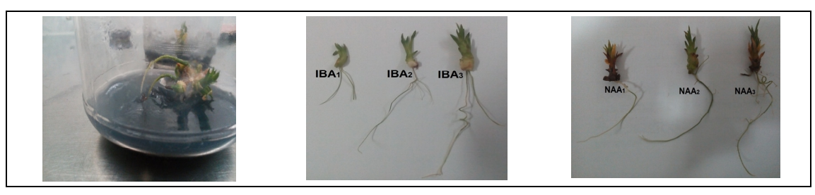
Fig. 3. Effect of IBA and NAA treatments on Dracaena umbraculifera . Treatments from left to right: auxins concentration (1) at 0.1, (2) at 0.2 and (3) at 0.3 ppm for each.

Means within a column or row having the same letters are not significantly different according to Duncan's New Multiple Range t-Test at 5% level.