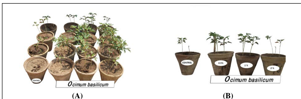
Fig. 3. Effect of sweet basil essential oil (A), at three concs. 0.5%, 1% and 2% (B) on Fusarium oxysporum infection of roselle plants compared with control.