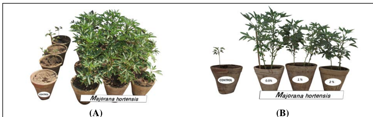
Fig. 1. Effect of marjoram essential oil (A), at three concs. 0.5%, 1% and 2% (B) on Fusarium oxysporum infection of roselle plants compared with control.